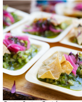
Copita Spring Ceviche