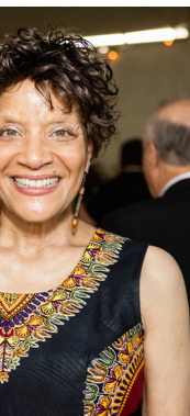
ell, Lifehouse Board