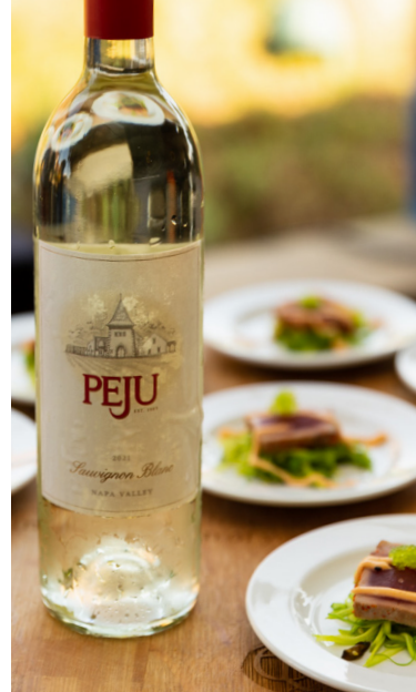
Peju Province Winery